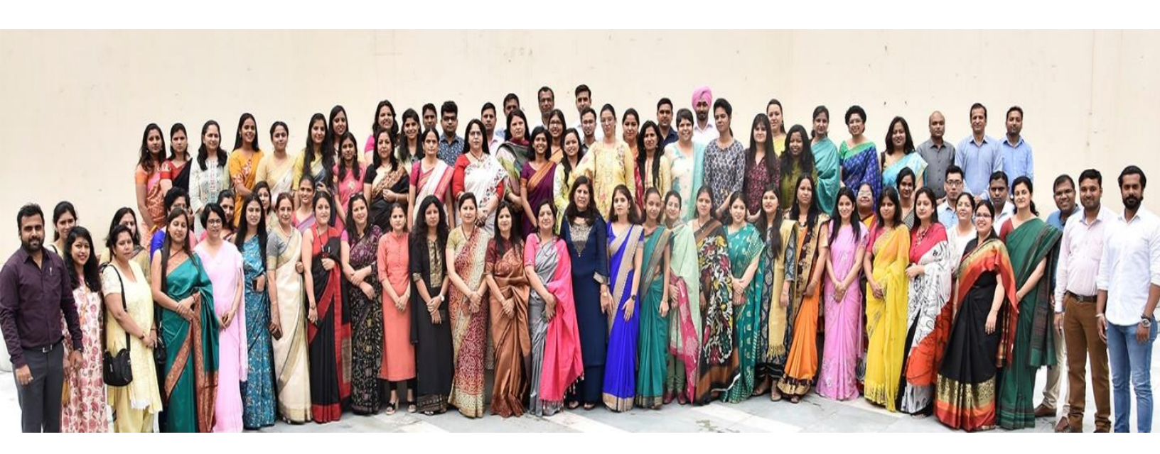
Faculty of the college

To build & nurture a new generation of professionals by providing them education with a holistic perspective. To imbibe strong ethical values so that they can work as positive change agents in the new millennium. It will be our endeavour to assimilate and disseminate practical strategies to future professionals and to encourage their understanding of strategic perception to fulfill the mission of the organization in the fast – changing global environment.