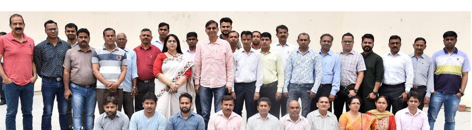
Para – Teaching staff of the college