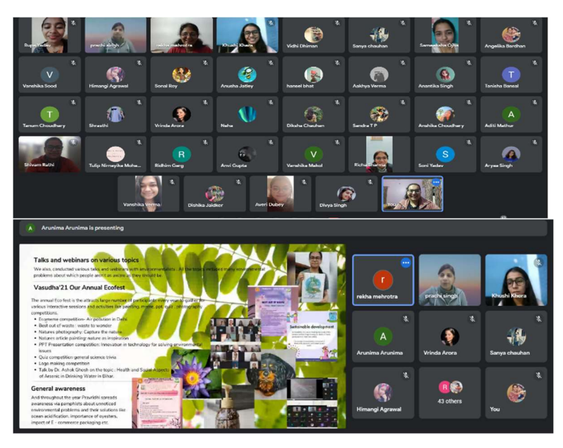
Orientation program of the Eco-club in December '21

Display board of the Eco-club showcasing its objectives, structure and activities.