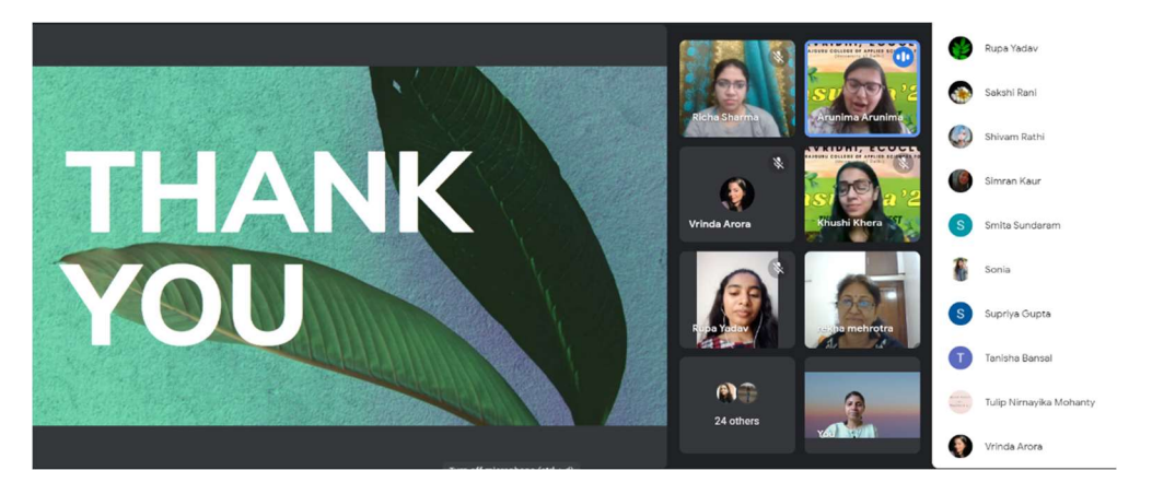
Valedictory, Eco-fest, Eco-club, February 27'2022