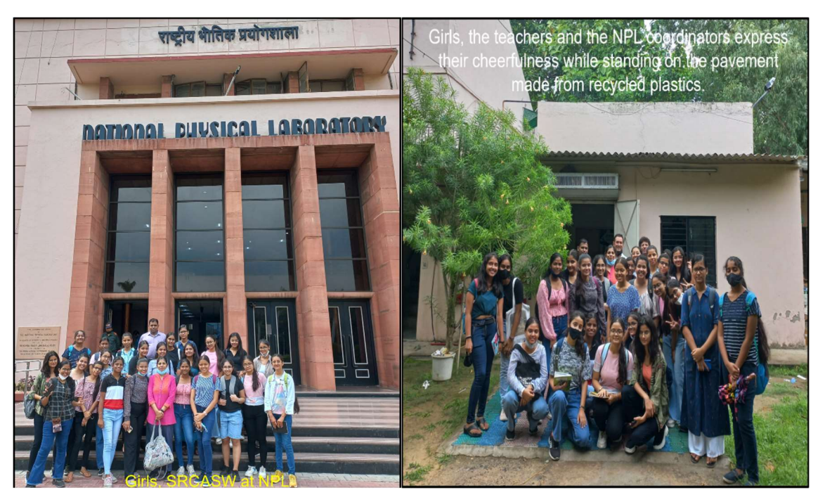
A Field visit to NPL, July'2022