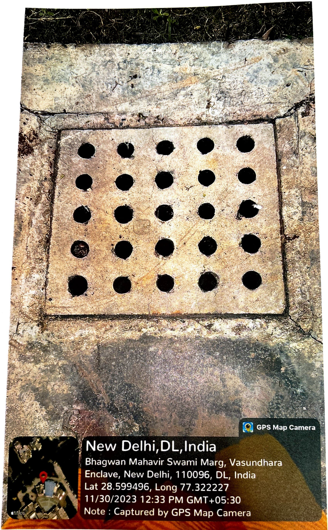
Water harvesting systems

A handwritten signature in blue ink, consisting of stylized, cursive letters.