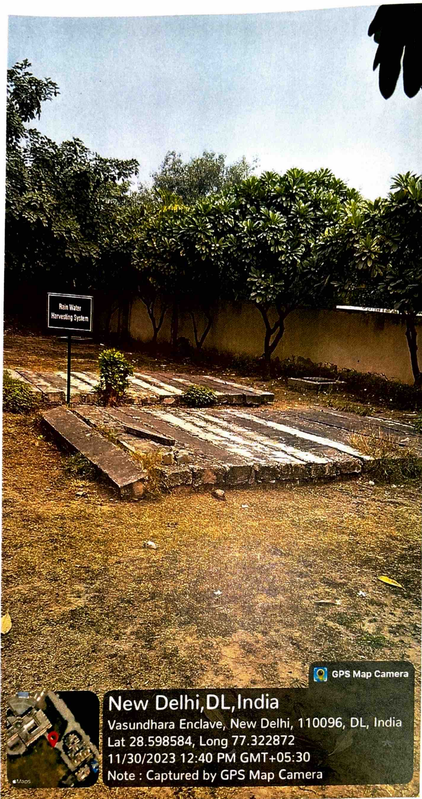
Rainwater harvesting pits