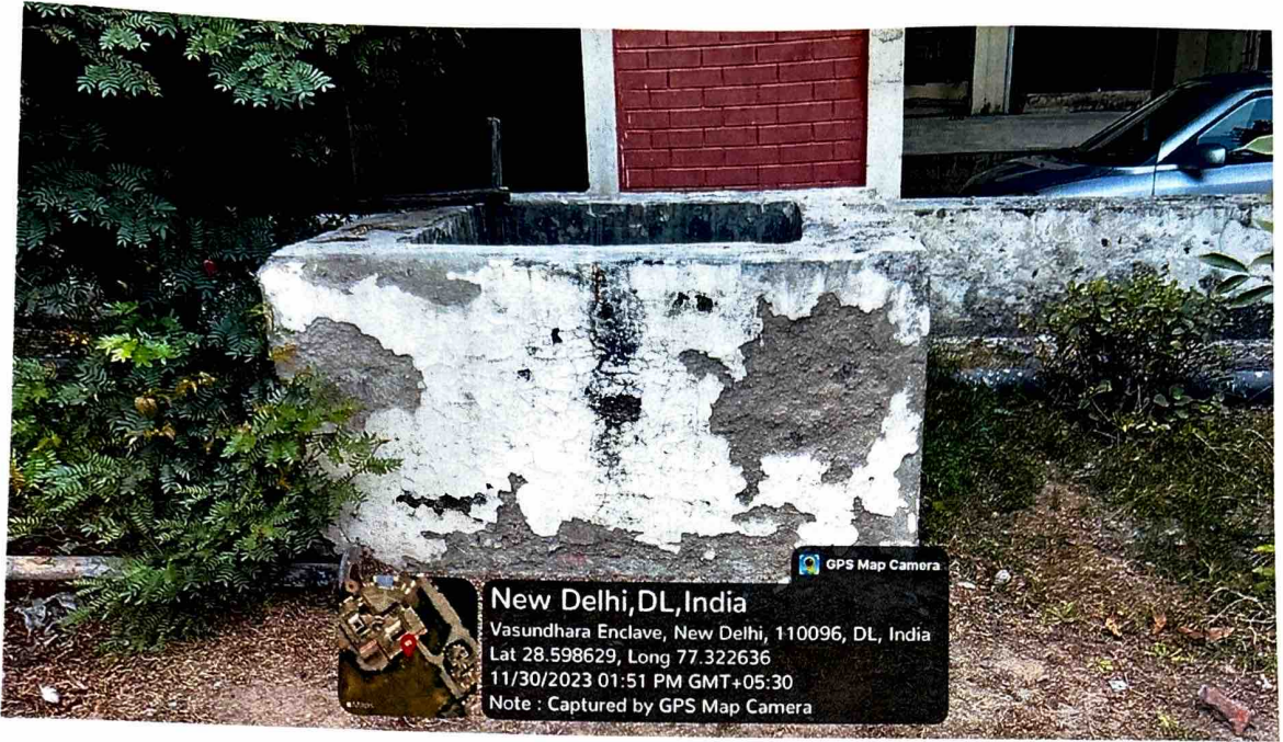
Water storage tanks