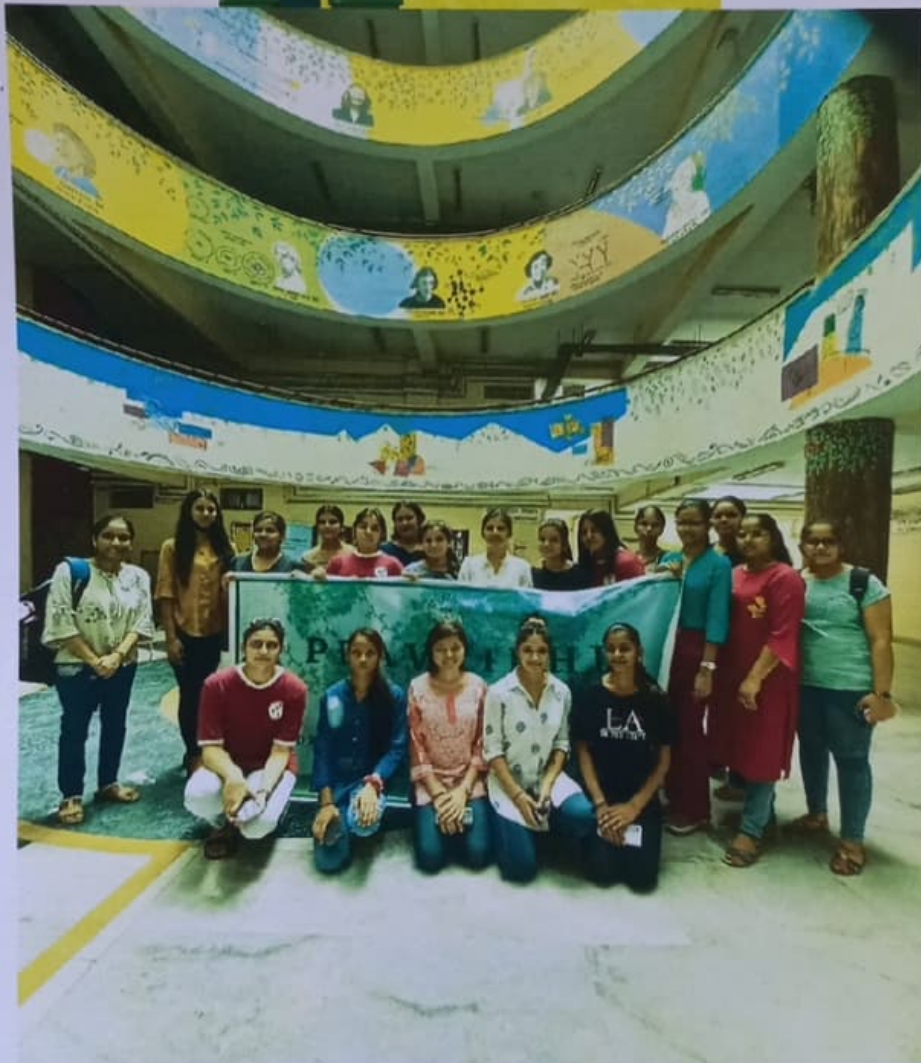
Waste segregation Drive

A handwritten signature in blue ink, likely of the person who organized or supervised the event.