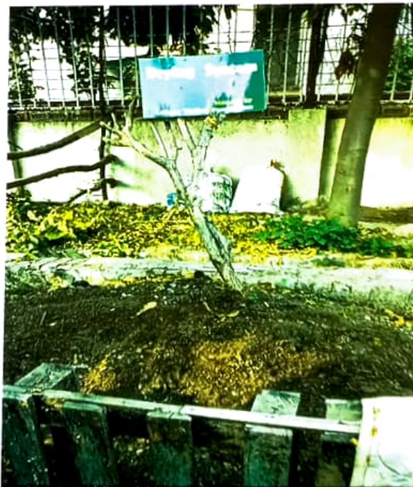
Shredder for manufacturing Compost

Unnamed Road, Vasundhara Enclave, Noida, Delhi 110096, India