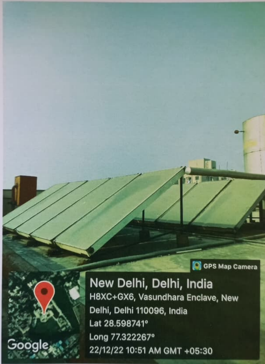
Solar Panels installed for alternative energy supplies