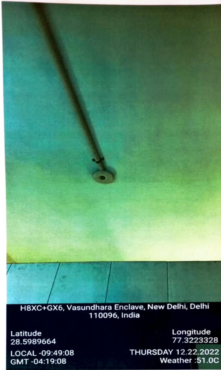
Light sensors in toilets_2