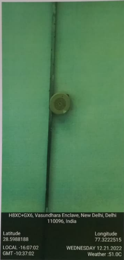
Fire alarm sprinkler system