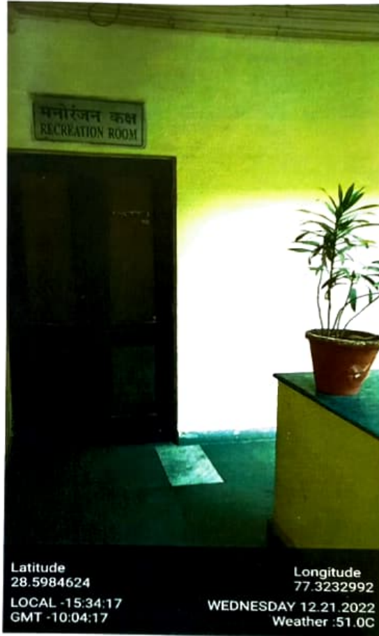
Recreation Room Facility (Hostels)