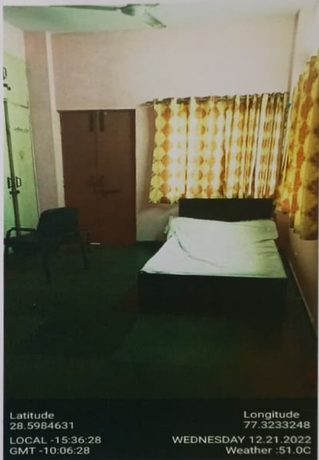
Matron's Room (Hostel)