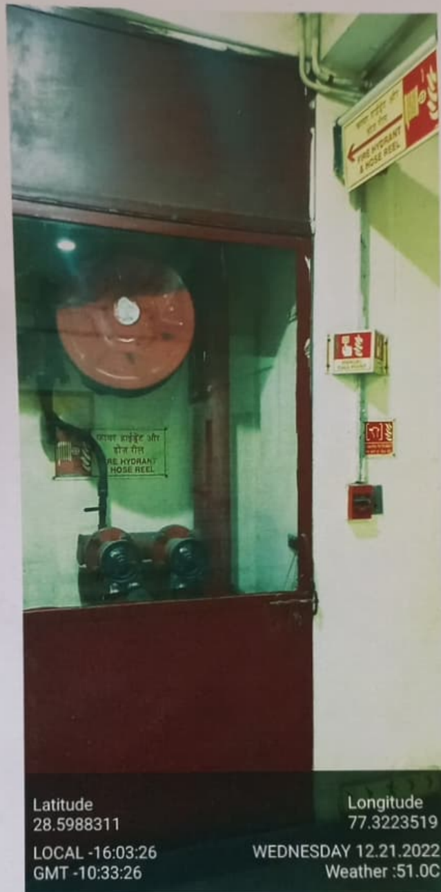
Fire extinguishing systems