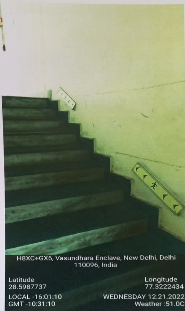
Disaster guiding strips