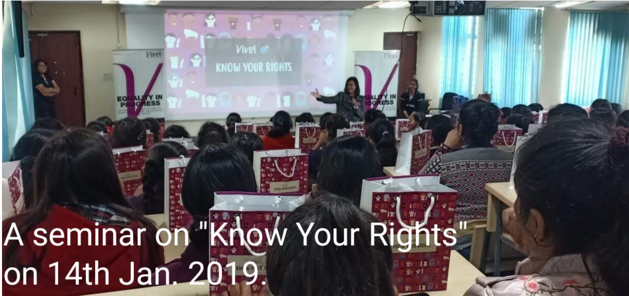
A seminar on "Know Your Rights" on 14th Jan. 2019.