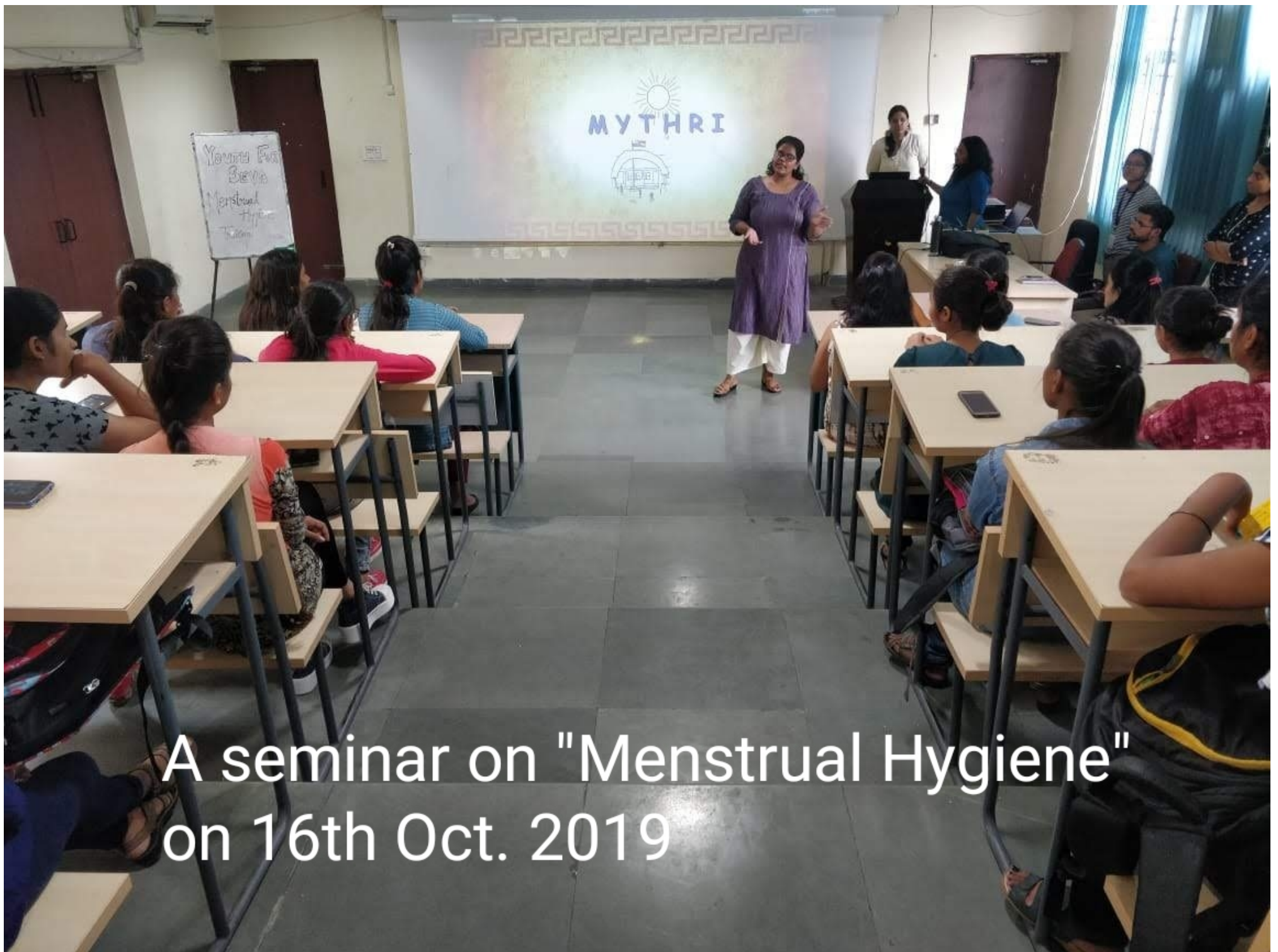
A seminar on "Menstrual Hygiene" on 16th Oct. 2019