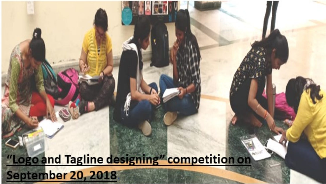
“Logo and Tagline designing” competition on September 20, 2018