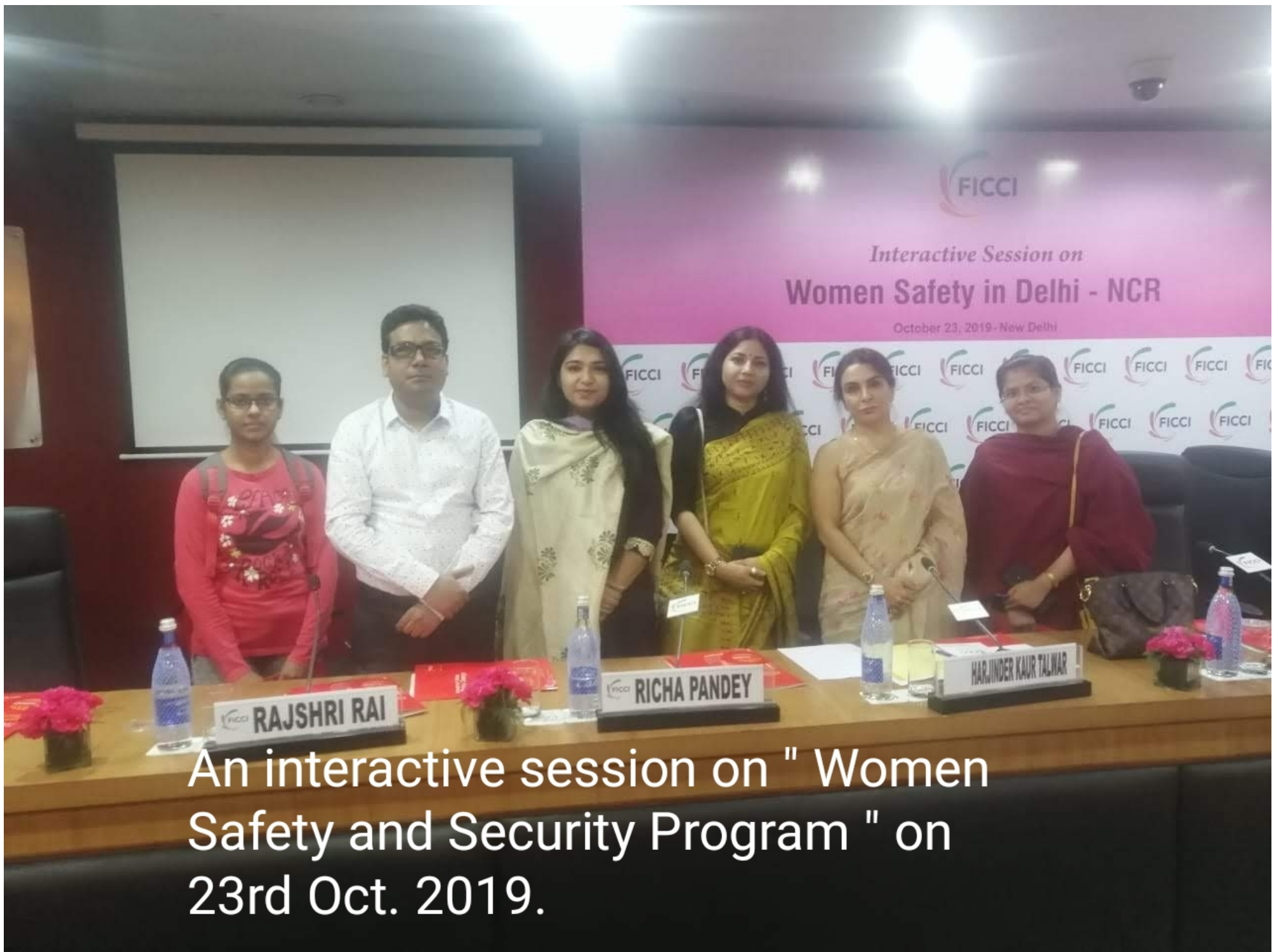
An interactive session on " Women Safety and Security Program " on 23rd Oct. 2019.