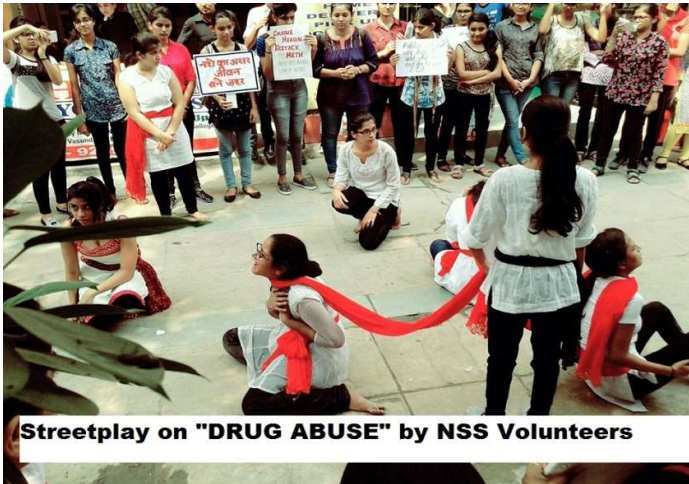
Streetplay on "DRUG ABUSE" by NSS Volunteers