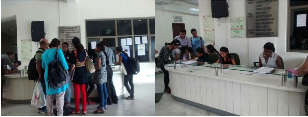
Poster Making Competition