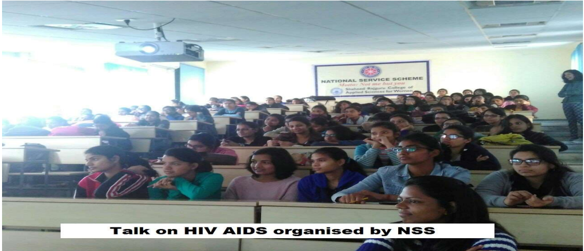
Talk on HIV AIDS organised by NSS