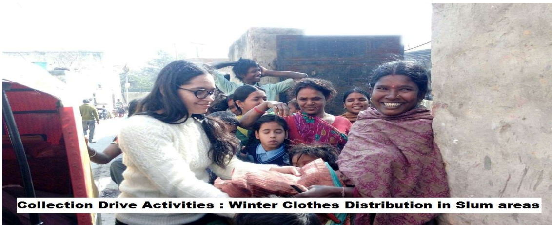
Collection Drive Activities : Winter Clothes Distribution in Slum areas