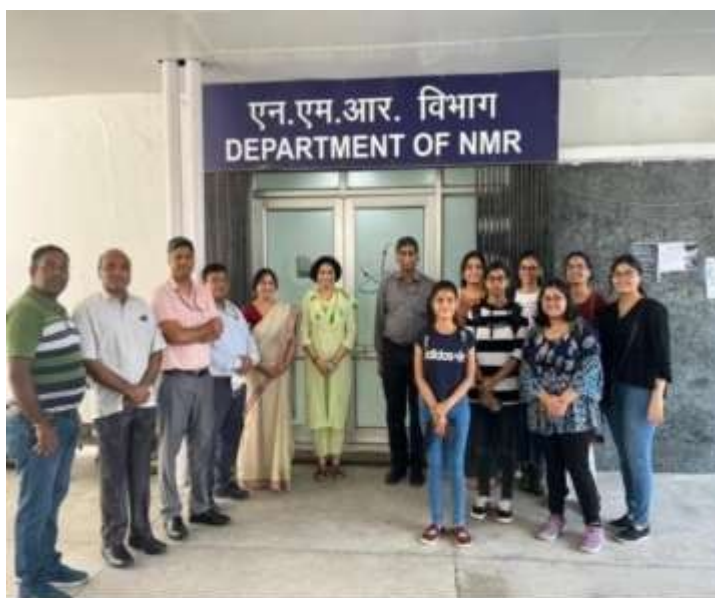
AIIMS Campus, Ansari Nagar, H686+X8W, Ansari Nagar East, New Delhi, Delhi 110029, India