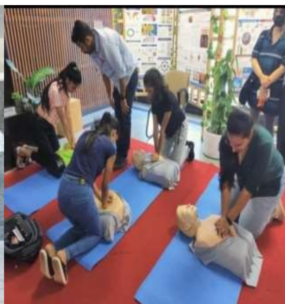
AIIMS Campus, Ansari Nagar, H686+X8W, Ansari Nagar East, New Delhi, Delhi 110029, India